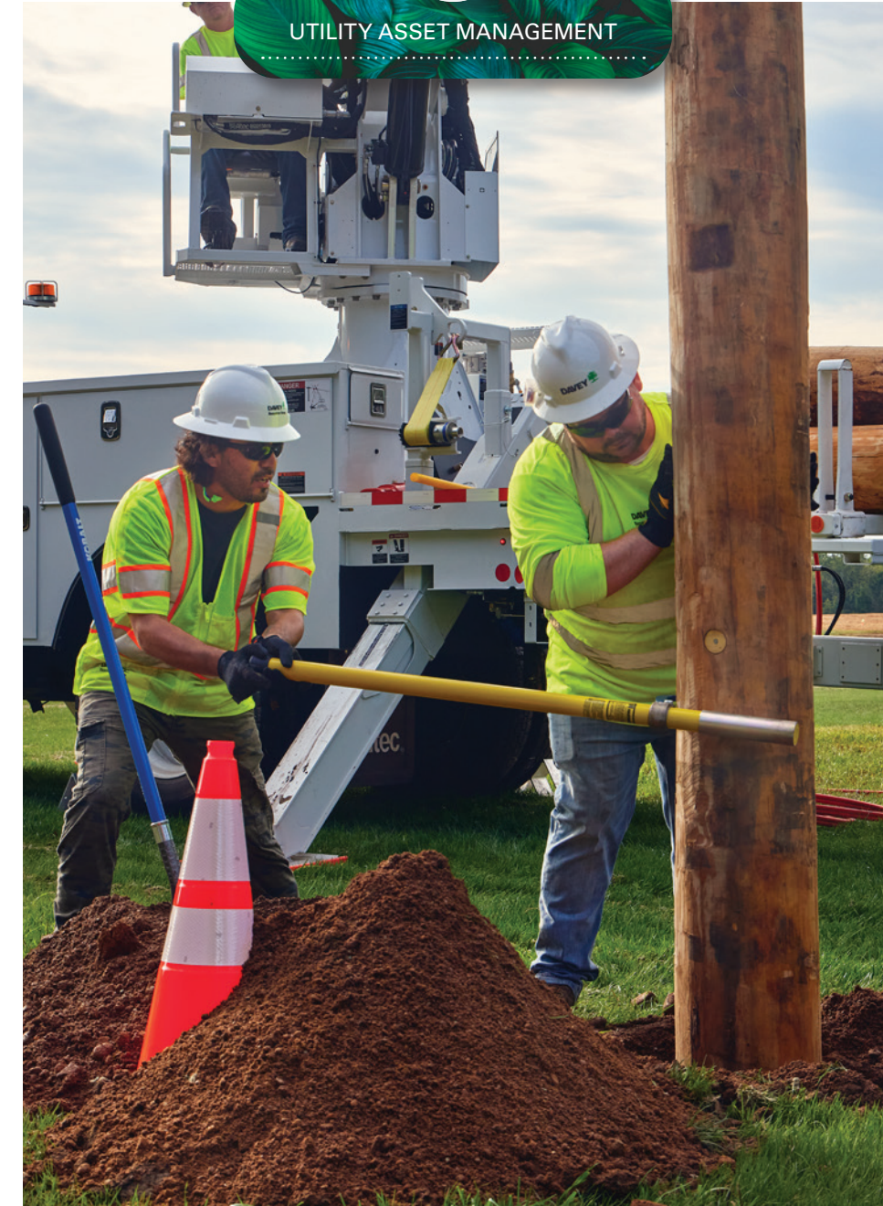
CLICK UTILITY ASSET MANAGEMENT