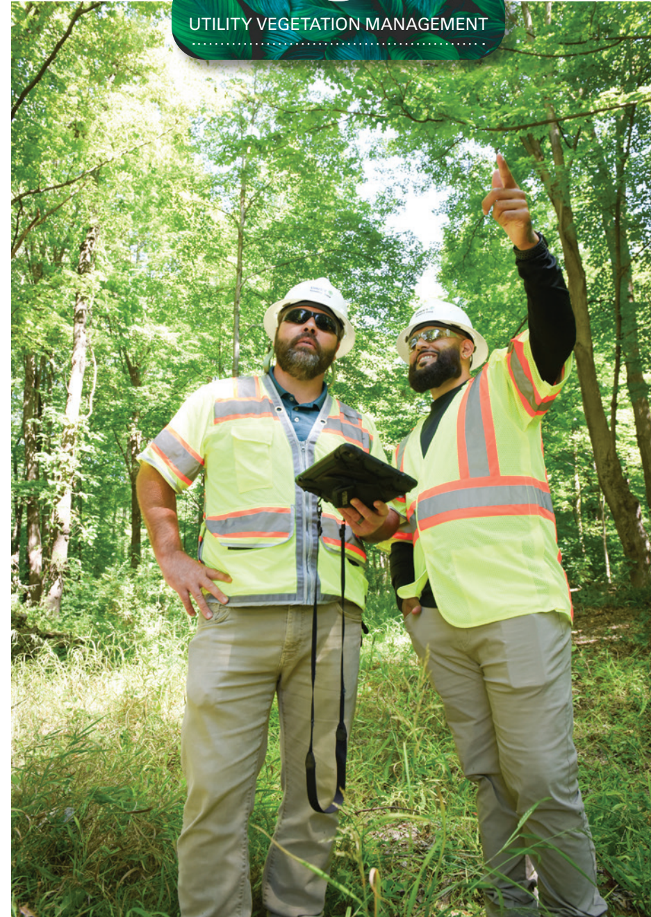
CLICK UTILITY VEGETATION MANAGEMENT

In 2024, our Canadian operations achieved steady growth in both revenue and profitability. The Residential segment led this performance, recording a 4.8% increase in revenue compared to 2023. Meanwhile, the Utility segment saw a 1% decline in revenue, largely due to a reduction in wildfire restoration activities that contributed $7 million in revenue in 2023. Excluding this factor, the Canada Utility segment would have experienced a 13.9% year-over-year revenue increase. Overall, it was a successful year, and we commend the